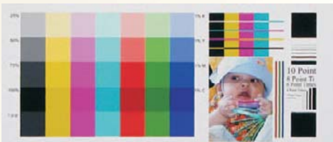
Color photographic test print, after being immersed in water and air-dried.

the same way as black-and-white prints, but they show less distortion after they dry. Because color prints have a plastic layer between the image and the paper, they are less likely than black-and-white prints to become discolored in the white areas. A wet color print, like a black-and-white print, will stick to an adjacent print.