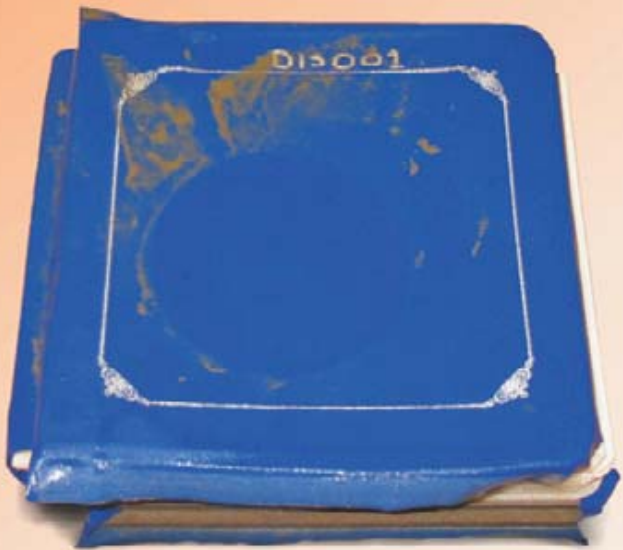
Water-soaked album showing cover damage.