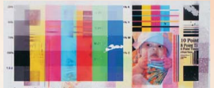
Ink jet dye print on microporous paper, after immersion in water and blotter-drying. Some flaking, dye bleeding, and image transfer are evident.