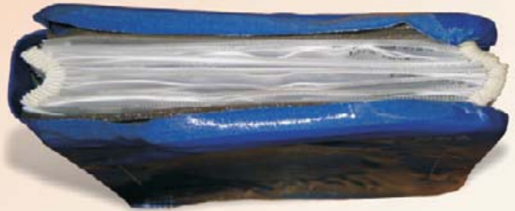
Water-soaked album showing cover damage and page distortion.

fabric, plastic, paper, or leather may separate from the cover's cardboard core. The adhesive securing the pages within the album cover may dissolve.