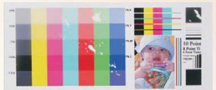
Ink jet pigment print on microporous paper, after immersion in water and blotter-drying. Flaking of image can be seen. Image shows no dye bleeding.